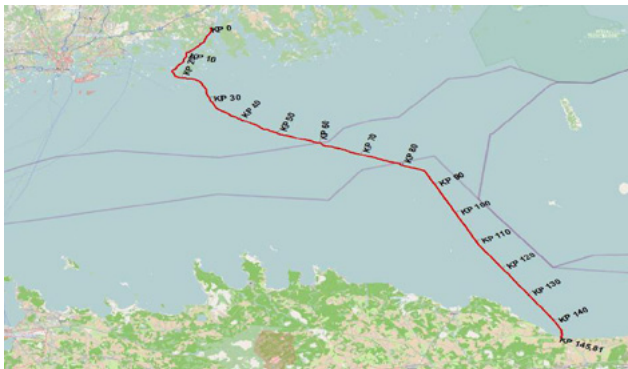
EstLink 2 marine cable route

EstLink 2 cable crosses with several power cables, telecommunication cables and gas pipelines in the gulf of Finland. Prior to the construction of crossings the crossing agreements with crossed cable owners will be signed.