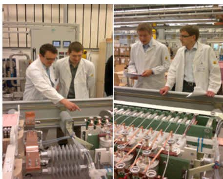
Valve testing in Nürnberg, Germany

EstLink 2 system studies are completed, type and routine tests are ongoing both for HVDC converter stations and cables. The factory acceptance cable tests will be completed in summer 2012 and converter station factory acceptance tests by the end of 2012. Equipment installation is scheduled to be started in 2012.