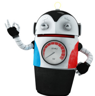
Mr. Mega Watt from EstLink 2 animation

EstLink 2 cable crosses with several power cables, telecommunication cables and gas pipelines in the gulf of Finland. Prior to the construction of crossings the crossing agreements with crossed cable owners will be signed.