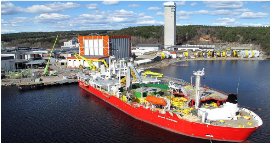
EstLink 2 marine cable installation vessel C/S Nexans Skagerrak in the cable factory in Halden, Norway

EstLink 2 cable installation is planned to be performed from August 2012 to December 2012 by Nexans Norway AS. Before the cable installation starts a pre-lay survey will be performed in summer 2012. Also the preparatory works in near shore areas like horizontal directional drilling to Estonian landfall and possible rock clearance works in near shore areas will be carried out in summer 2012. Marine cable installation will be carried out in two campaigns of approximately 75 km each. The laying of marine cable is scheduled to be started from Estonian