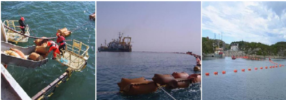
Typical floating operations