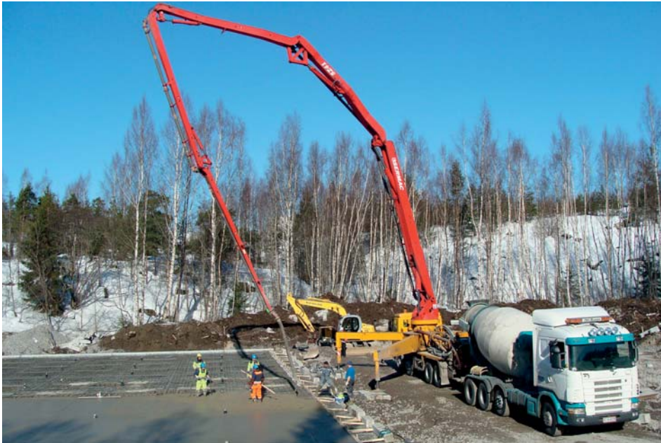
Anttila SS and Nikuviken TS preparatory civil works will be finalized in June 2011